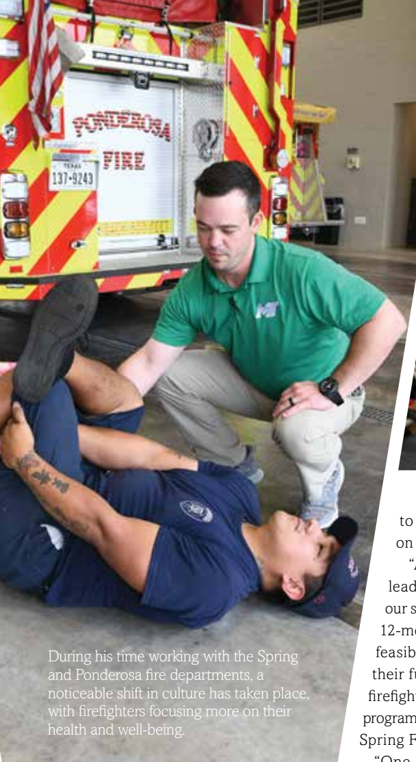
During his time working with the Spring and Ponderosa fire departments, a noticeable shift in culture has taken place, with firefighters focusing more on their health and well-being.