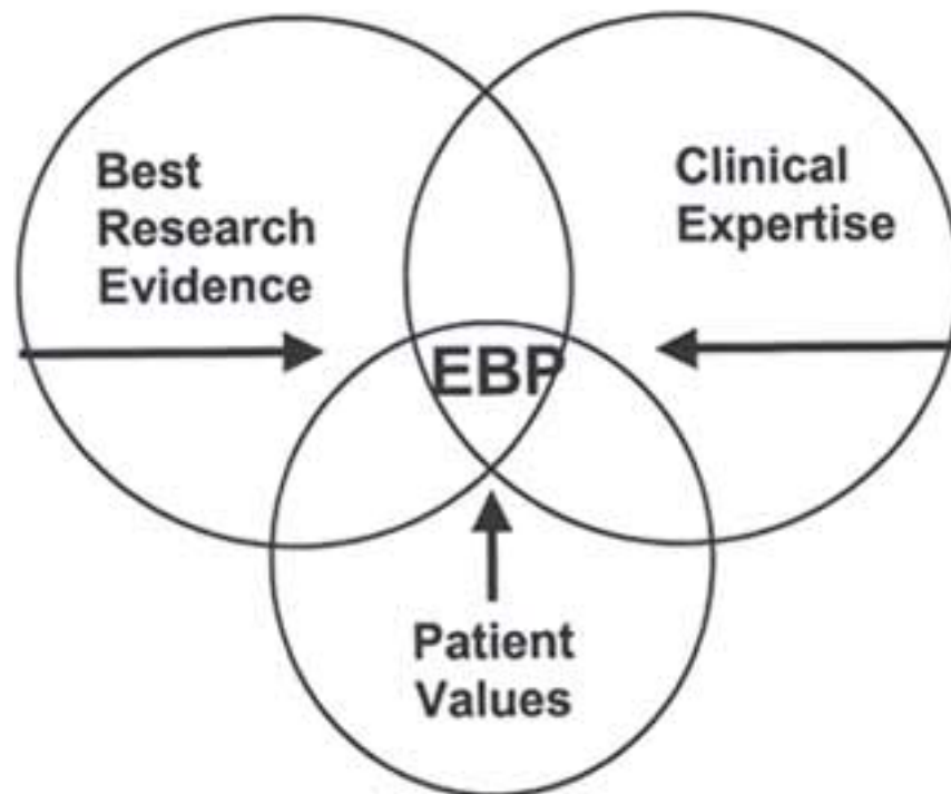
Figure 2. Evidence-based practice is the product of integration of information from three important sources: new knowledge generated from clinical research, practitioner's clinical experience and expertise, and patient values, concerns, and expectations.

There are five essential steps in the EBP process: 40,41,43-47